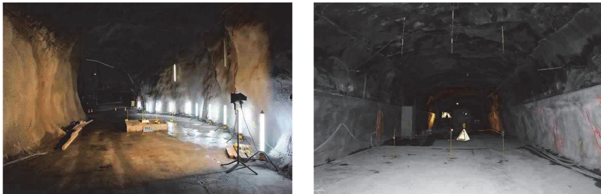
Figure 2: Test site (left) and subsequent fire tunnel where samples were taken (right)

The driving fan was located in the fire tunnel downstream of the test site (see Figure 1 and Figure 2). It was placed in the centre of the fire tunnel and provided a constant, homogenised air flow with an average speed of 1.0 - 1.5 m/s. All kinetic, thermal and chemical risks for the test personnel arising from the experiment were mitigated with appropriate safety precautions.