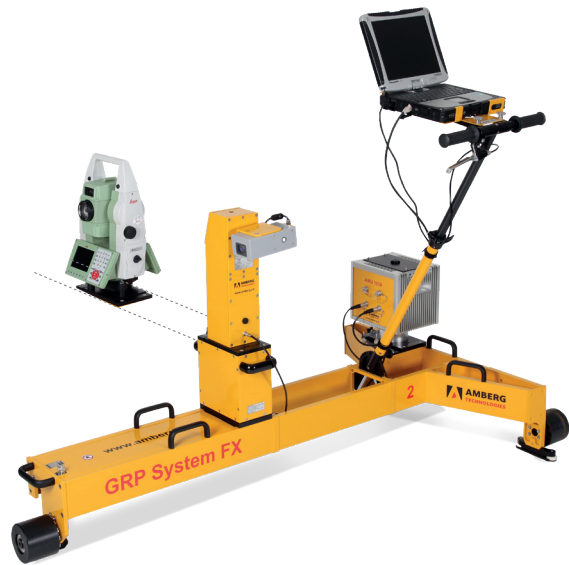
Front: Amberg IMS 3000 with Profiler 110 FX Back: Total station for Amberg IMS 1000