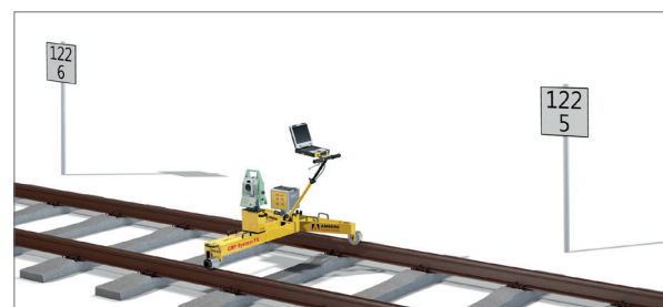
Relative track geometry survey with Amberg IMS 1000