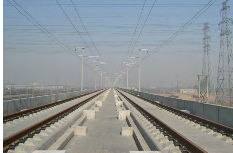
New high-speed line section Beijing-Tianjin, China, ready for the Olympic Games in August 2008.

Timely completion of construction work in the run-up to the Olympic Games is remarkable proof of the power and reliability of the GRP 1000 system, particularly in view of the special demands of a major Chinese building site.