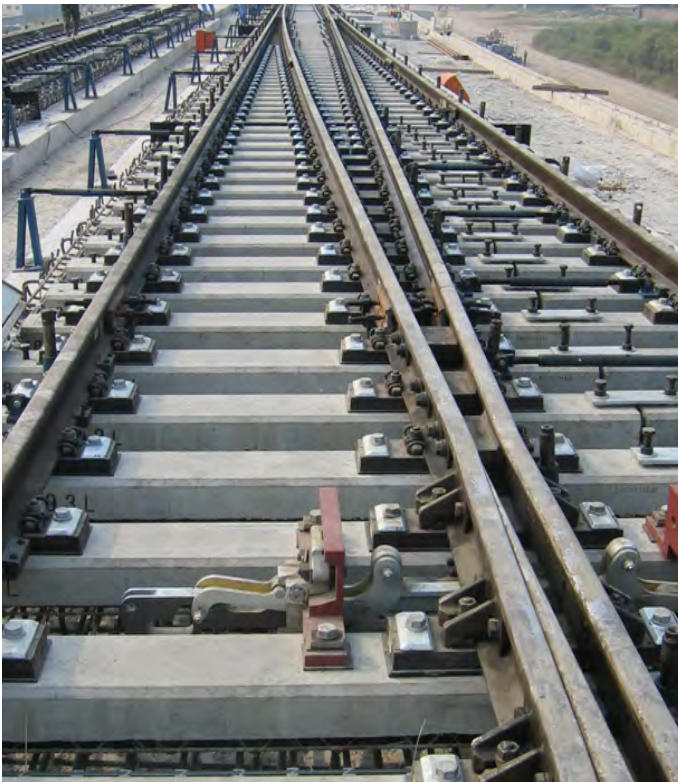
Positioning completed and ready for concreting. Installation of BWG high-speed turnouts with lead curve radii of up to 10'000 metres.

The GRP 1000 allows fast, efficient track surveying. Thanks to a well-thought out operating concept that caters for the special requirements during construction, tracks can be built with millimetre accuracy and comprehensively documented for quality assurance purposes. The real-time results returned by the GRP 1000 contribute significantly to fast execution of construction work. Precise measuring with GRP 1000 provides a basis for immediate release of subsequent processes (e.g. track slab concreting work). This helps prevent incorrect positioning of points. (It is not possible to correct the position of points once they have been concreted without expensive and time-consuming dismantling.) Final track acceptance using the GRP software serves the purpose of quality control and as the building contractor's documentation for the client. The results of the analyses with the special Slab Track software with regard to deviations of position and relevant track geometry criteria are an important addition to acceptance of dynamic behaviour using track surveying vehicles.