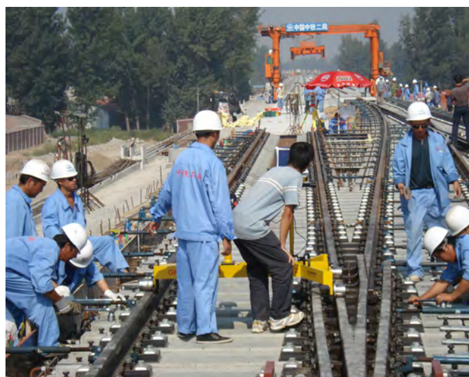
Precise and fast turnout positioning with the aid of the precise and robust measuring system GRP 1000.

For the first time, Chinese building contractors have used modern Swiss surveying technology for track building. The surveying task involved high-precision positioning of 24 high-speed turnouts and complete geometric acceptance surveys of the high-speed section between Beijing and Tianjin.