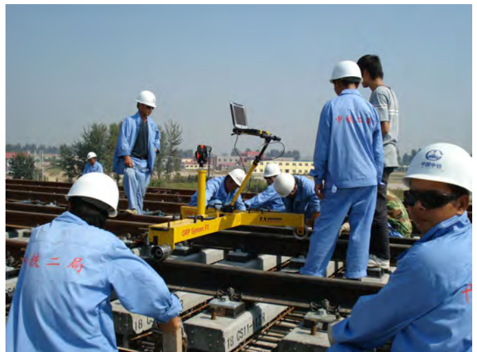
Automatic correction data in real time - low error rate, high performance and excellent track quality.