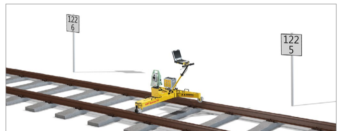
Relative track geometry survey with Amberg IMS 1000