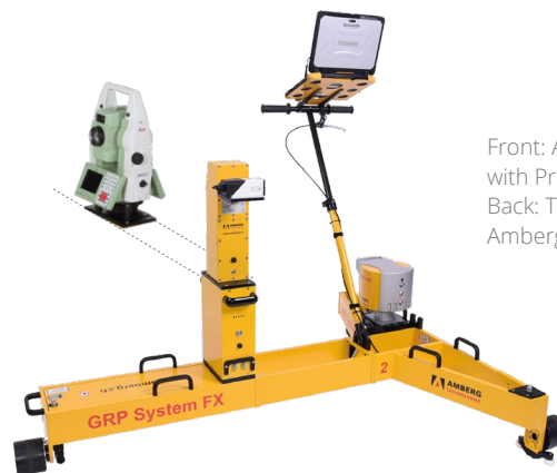
Front: Amberg IMS 3000 with Profiler 120 FX Back: Total station for Amberg IMS 1000